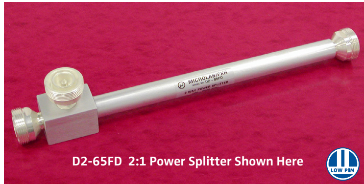
D2-65FD 2:1 Power Splitter Shown Here

Microlab Model Dx-85FC series of 2, 3 and 4 way Power Splitters has been designed to evenly split high power cellular signals with minimal reflections and loss. Joints are moisture sealed with gaskets to meet IP67. The rugged, lightweight design can be easily attached to a wall with the supplied bracket and clip.